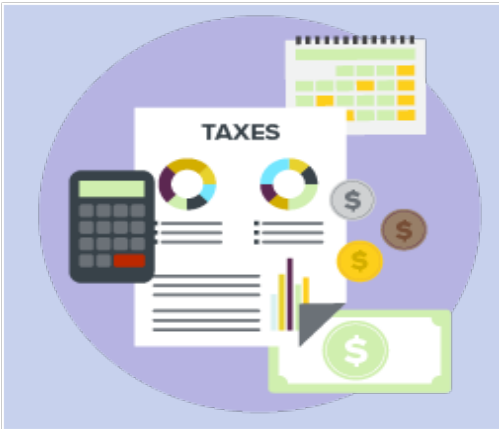
Voluntary File & Pay – Customer Service