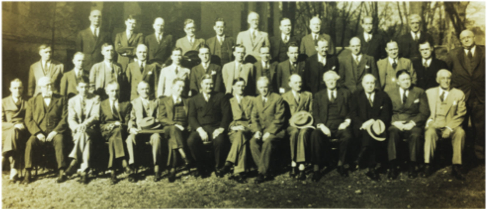
National Association of Tax Administrators-1934